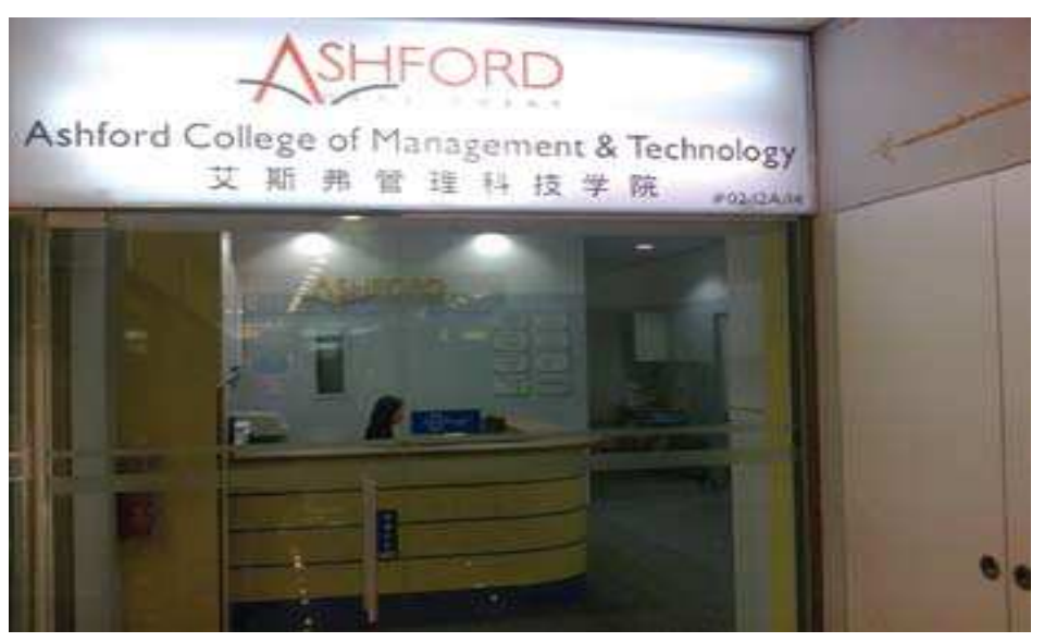
The reception of ACMT, Singapore

Ashford College of Management & Technology (ACMT), a member of Ashford Management, was established and registered with the Ministry of Education, Singapore in 2002 as Amgt Management School, to provide quality educational and training services for individuals and organisations.